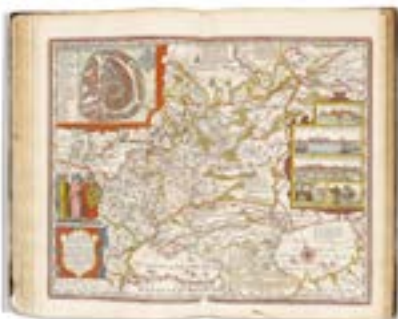
A164 / 416 NICOLAES VISSCHER the younger „Atlas minor sive geographia compendiosa.“ With numerous copper maps. Amsterdam, ca. 1706. The map engravings circa 1634- 1705.