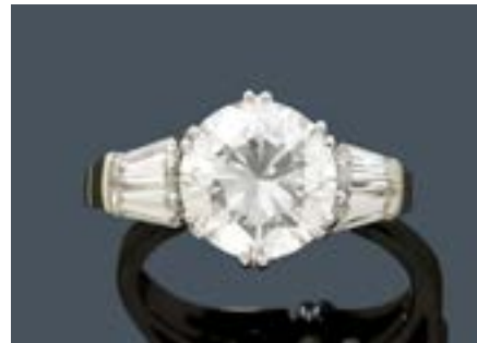
A164 / 2061 DIAMOND RING, circa 1900.