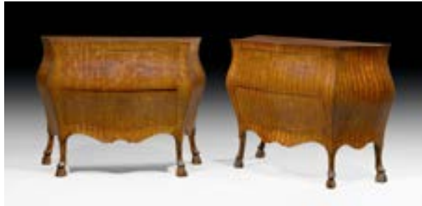
A164 / 1120 PAIR OF COMMODES, Louis XV, probably Lombardy, 18th century.