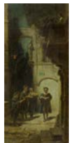
A164 / 3210 CARL SPITZWEG (1808 Munich 1885) Serenade. Oil on board. Monogrammed: S in rhomb. 30.9x14.5 cm.