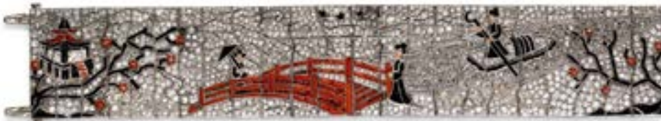
A164 / 2153 BRACELET WITH ONYX, CORALS AND DIAMONDS, Laclache Frères, circa 1925.