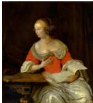
A164 / 3058 EGLON HENRIK VAN DER NEER (Amsterdam 1635/36-1703 Düsseldorf) Noble lady with lute and sheets of music, sitting on a table. Ca. 1667. Oil on panel. Signed and dated: E. van der Neer. 1667/9 (?). 31.6x28.8 cm.