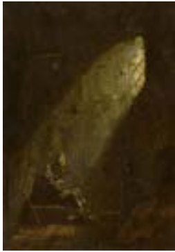
A164 / 3207 CARL SPITZWEG (1808 Munich 1885) Ash Wednesday. Oil on panel. 21x14 cm.