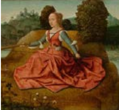
A164 / 3046 MASTER OF FRANKFURT (active in Antwerp, circa 1460) Allegory of love. Oil on panel. 24.8x128.3 cm.