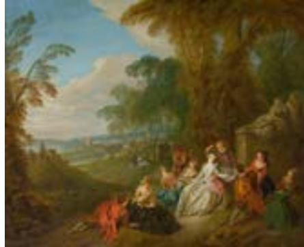
A164 / 3038 JEAN-BAPTISTE PATER (Valenciennes 1695-1736 Paris) Fête champêtre. Oil on canvas. 89x110 cm.