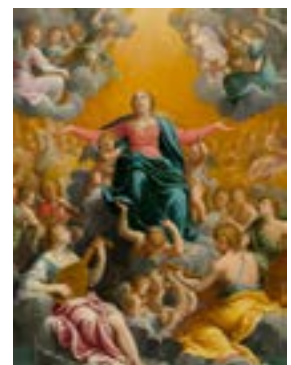
A164 / 3023 GUIDO RENI (Calvenzano 1575-1642 Bologna) The Assumption. Oil on copper. 58x44.4 cm.

The Old Master Paintings auction had two main points of focus: on the one hand, the 17 paintings from the collection of Wolfgang Joop and, on the other, the Old Master paintings from other provenances. In the second group was a painting on copper which had been in a private collection for over forty years: an early work by Guido Reni (1575-1642) depicting the Assumption of Mary and a clear testament to Reni's style at the beginning of his painting career. Estimated at CHF 120 000 the painting made a final price of CHF 1.2 million at the Koller auction on 22 March (lot 3023). The painting "Noble woman at a table with lute and sheet music" by the Dutch artist Eglon Henrik van der Neer from 1667 made CHF 515 000, a final price which was also far above the catalogue estimate. This work had hitherto only been known to experts through its documentation and had been rediscovered by Koller after the surface had been cleaned. It had been estimated at CHF 200 000/300 000 (lot 3058). The still life "Woven basket with fruits on a table top with insects" by Isaac Soreau, which was consigned to Koller from a private collection, reached a price of CHF 324 000 (lot 3034). A collector was prepared to pay CHF 260 000 for a still life of flowers by Johannes van der Ast, a price also above the estimate, which had been set at CHF 150 000 (lot 3061).