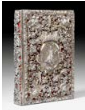
A164 / 343 SILVER BINDING , Augsburg (?), late 17th century.