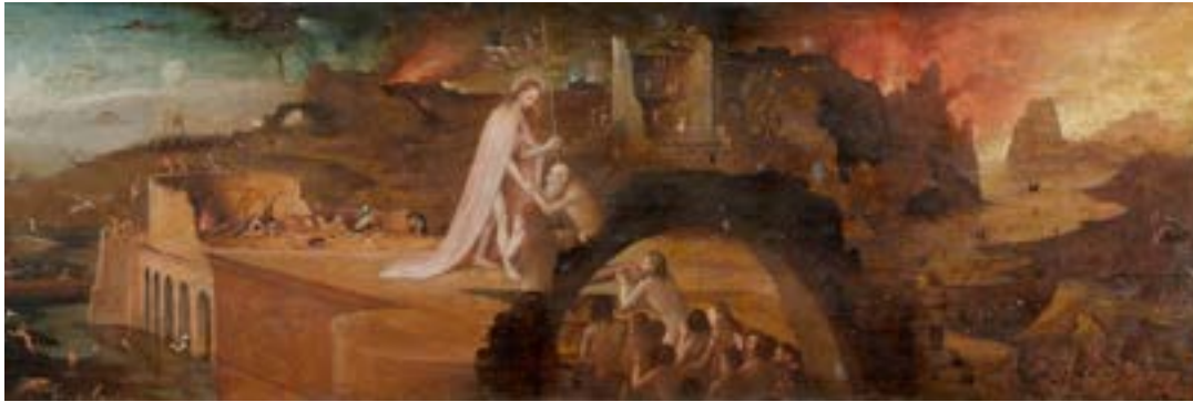
A164 / 3017 HIERONYMUS BOSCH , successor, probably circa 1600. Christ in limbus. Oil on panel. 19.6x58.7 cm.