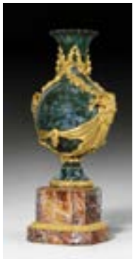
A164 / 1207 AGATE VASE WITH BRONZE MOUNT, Louis XVI, Paris, 18th/19th century.