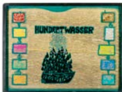
A164 / 632 FRIEDENSREICH HUNDERTWASSER . „Look at it on a rainy day.“ Complete set of 10 original serigraphies with metal imprinting. 49.4x66.5 cm. In original box.