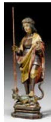
A164 / 1036 SAINT GEORGE, late gothic, Southern Tyrol, circa 1520.