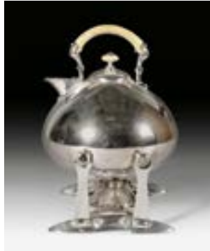
A164 / 1866 TEAPOT WITH RECHAUD, mark Fabergé and Moscow 1899-1908.