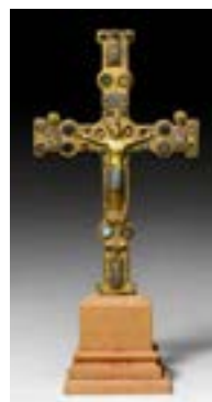
A164 / 1029 CROSS, Limoges, early 13th century.