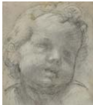
A164 / 3422 RAFFAELLO SANTI, workshop (Urbino 1483-1520 Rome) Head of a child. Black and white chalk on paper. 17.1x15.1 cm.