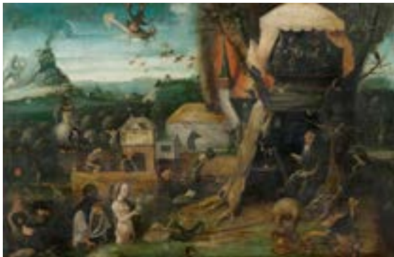
A164 / 3018 HIERONYMUS BOSCH , successor, probably circa 1600. The temptation of Saint Anthony. Oil on panel. 35x53.9 cm.