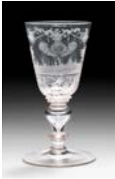
A164 / 1890 CHALICE, baroque, Bohemia, 18th century.