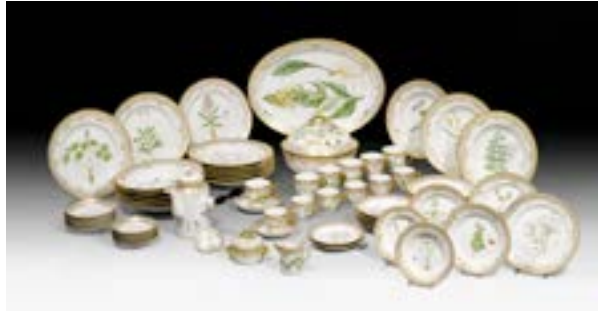
A164 / 1886 SERVICE "FLORA DANICA", Royal Copenhagen, modern.