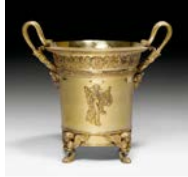
A164 / 1867 VERMEIL WINECOOLER, mark Odiot, Nuremberg 1596.