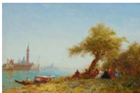
A164 / 3226 FELIX FRANÇOIS ZIEM (Beaune 1821–1911 Paris) Repos sous les arbres près de Venise. Oil on panel. Signed: Ziem. 52.2x80 cm.