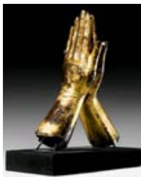
A164 / 1026 PRAYING HANDS, piece of a "figure gisante", Renaissance, Limoges, 14th century.