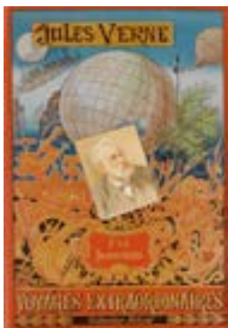
A164 / 391 JULES VERNES „Voyages extraordinaires“ Collections of 56 works with numerous engravings. Paris, Hetzel, 1868-1912.