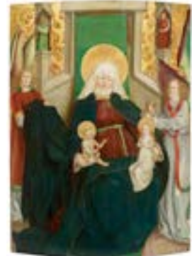
A164 / 3006A SOUTHERN GERMANY, 15th century Triptychon with Saint Anna, virgin Mary and child, Saint Jacob and John the Baptist. Oil on panel. 75x99.8 cm.