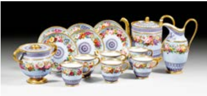
A164 / 1860 TEA SERVICE LOUIS-PHILIPPE WITH FLOWERS, Sèvres, circa 1834-1845.