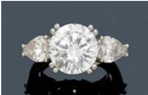
A164 / 2165 DIAMOND RING, 6.16 ct., E/VVS2*.