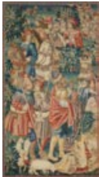
A164 / 1039 TAPESTRY „LES TROIS MAGES“ Renaissance, Tournai, circa 1520.