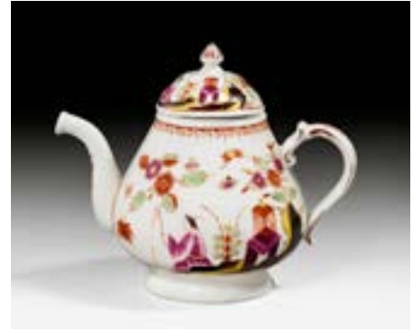
A164 / 1813 TEAPOT WITH CHINOISERIES, Nassau-Saarbrücken, Ottweiler, circa 1765-1789.