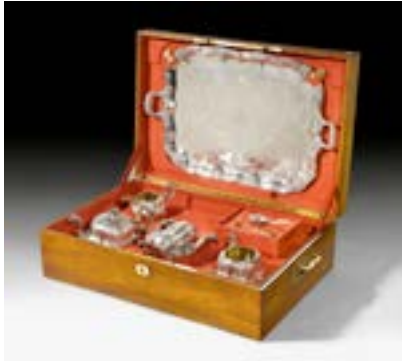
A164 / 1855 TRAVEL SERVICE, mark Charles Nicolas Odiot, Paris, circa 1840.