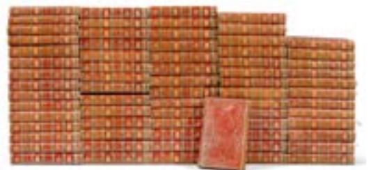
A164 / 394 VOLTAIRE . „Oeuvres completes.“ 70 tomes with numerous engravings and dedication with portrait of Friedrich Wilhelm II of Prussia. Kehl, Société Littéraire- Typographique, 1785-1789.