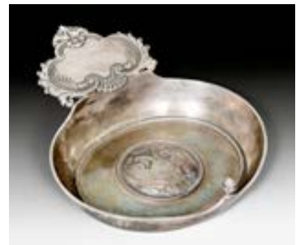
A164 / 1872 SILVER BOWL / „KOVSCH“, Russia, begin- ning of 20th century.