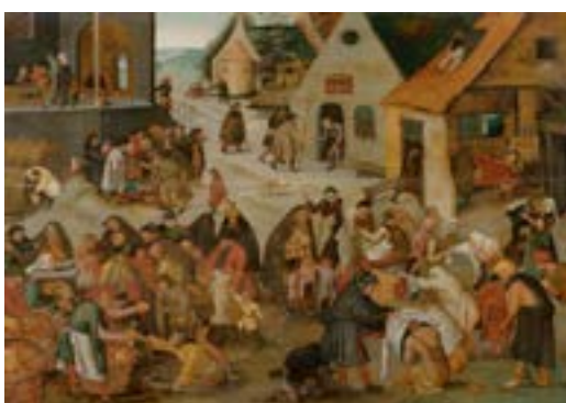
A164 / 3011 PIETER BRUEGHEL the younger , circle (Brussels 1564–1637/38 Antwerp) The seven acts of mercy. Oil on panel. 43x59 cm.