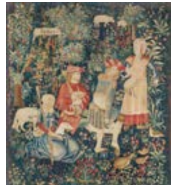
A164 / 1024 TAPESTRY, Renaissance, probably Northern France, circa 1500/1520.