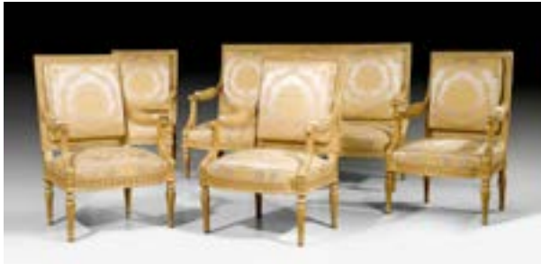
A164 / 1320 AMEUBLEMENT, late Louis XVI, Paris, circa 1820/1840.