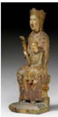
A164 / 1033 MARY WITH CHILD, romanic, Spain, 12th/13th century.