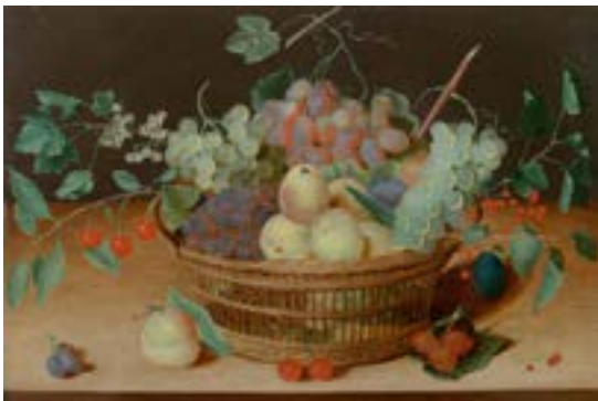
A164 / 3034 ISAAC SOREAU (1604 Hanau a.M. after 1638) Basket with fruits on a table with insects. Oil on panel. 38.5x56 cm.