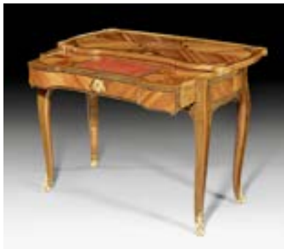
A164 / 1176 TABLE, Louis XV, stamped J.F. OEBEN, Paris, circa 1760.