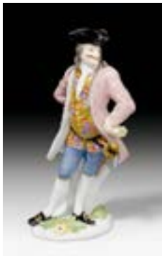
A164 / 1802 "CAPITANO SPAVENTO" FOR THE DUKE OF WEIS- SENFELS, Meissen, circa 1744.