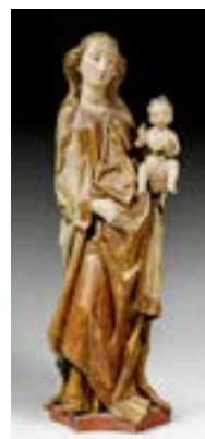
A164 / 1069 MARY WITH CHILD, late gothic, Middle Germany, circa 1500.