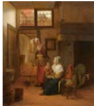
A164 / 3054 PIETER DE HOOCH (Rotterdam 1629–1683 Amsterdam) Interieur with mother, child and a servant. Oil on panel. Monogram: PH. 43.2x32.4 cm.