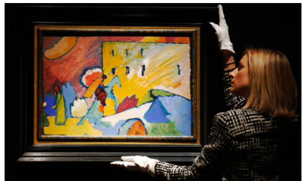
Wassily Kandinsky's Studie zu Improvisation 3 – not connected to the forgery bust – sold for $16.8m last week.

Around 100 officers from the federal police (BKA) raided a string of houses, businesses, warehouses and art galleries across the country on Wednesday and Thursday. Two suspects, aged 67 and 41, who are believed to head a group of six involved in the ring, were arrested in raids in Wiesbaden, where more than 1,000 objects were seized.