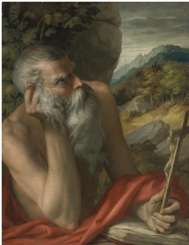
Parmigianino, Saint Jerome.