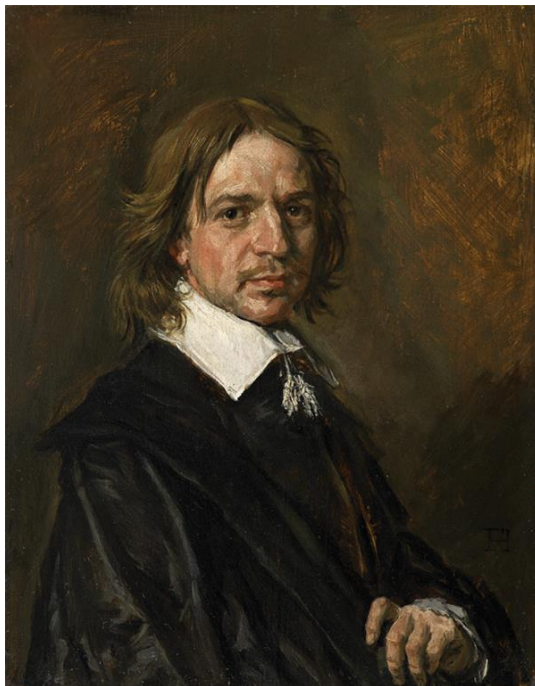
Franz Hals, Portrait of a Man , one of a series of Old Master works sold by a French dealer that authorities now believe may be forgeries.