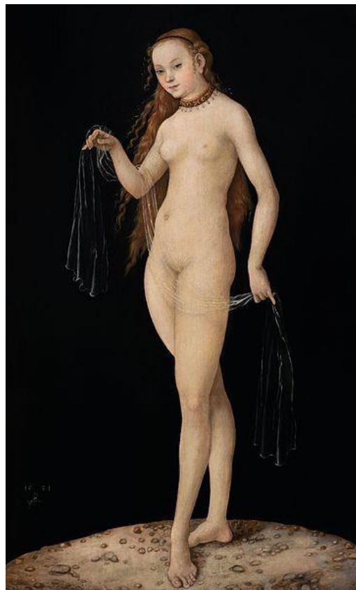
Lucas Cranach the Elder, Venus (1531).

The Hals refund is all the more concerning given how much press the painting received as a newly discovered treasure in the immediate past. In 2008, the Louvre launched a national campaign to buy the canvas for €5 million from Christie's Paris , declaring it "un trésor national." The Parisian museum wasn't acting lightly: the painting had been authenticated after passing a battery of scientific tests conducted by France's Center for Research and Restoration. At the time, Burlington Magazine called the work "a very important addition to Hals's oeuvre."