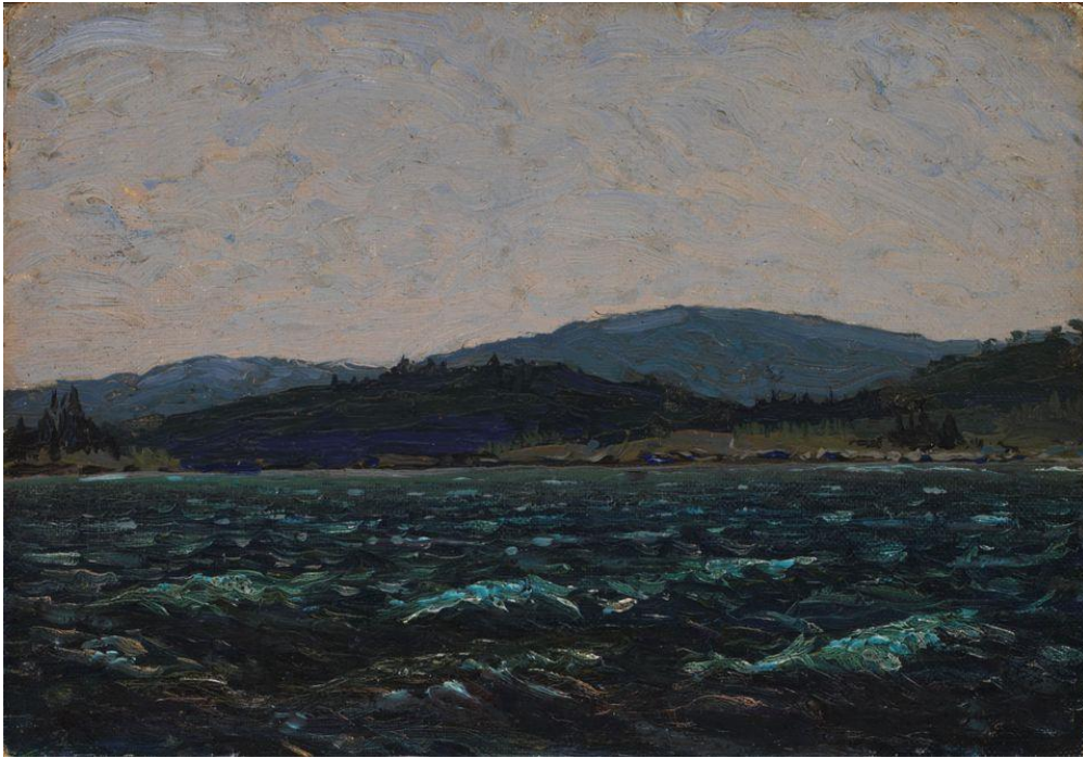
Tom Thomson, Sketch for Lake in Algonquin Park (1913)