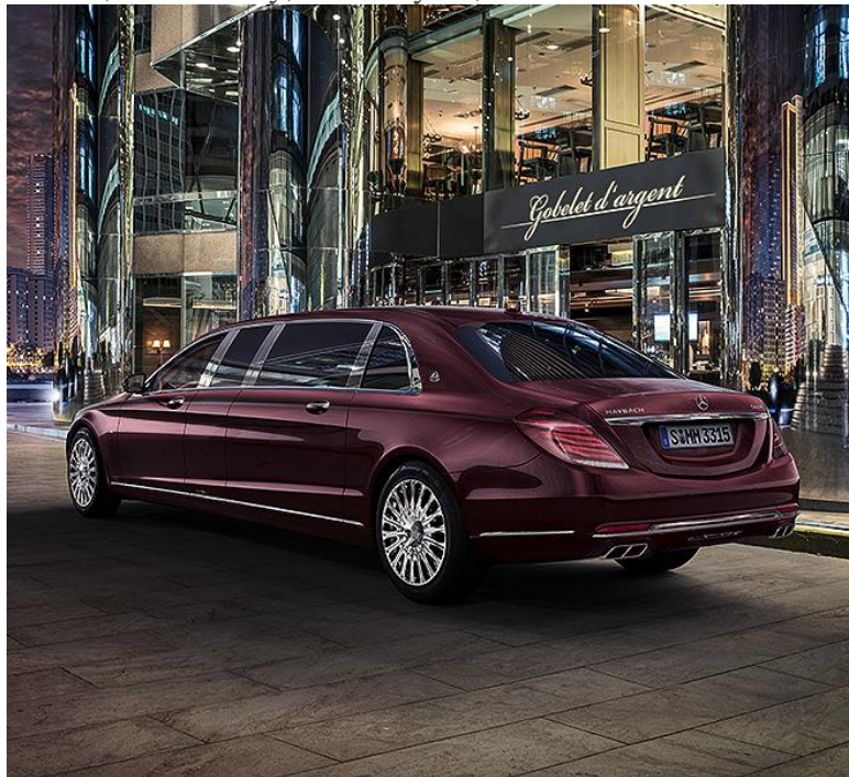
The Mercedes Benz Maybach Pullman.