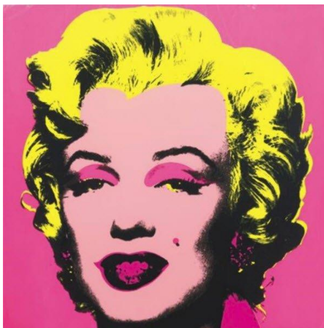
Andy Warhol, Marilyn Monroe (1967).