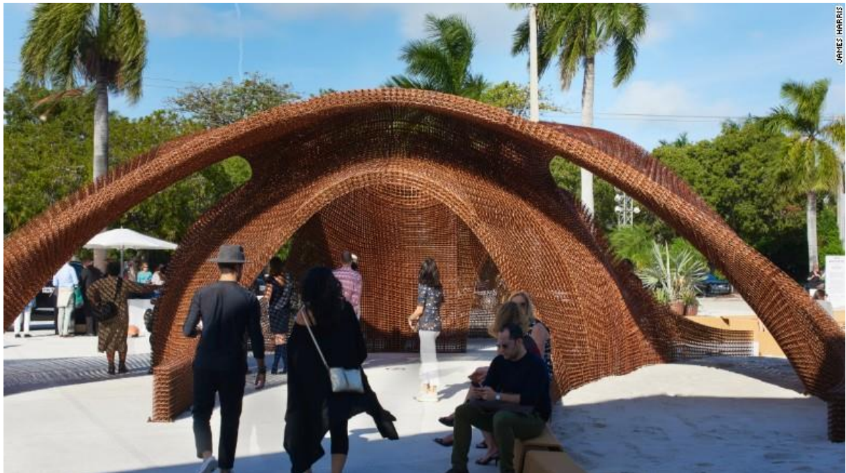
Photos: The best of Design Miami 2016

SHoP Architects – 'Flotsam & Jetsam' by SHoP Architects.