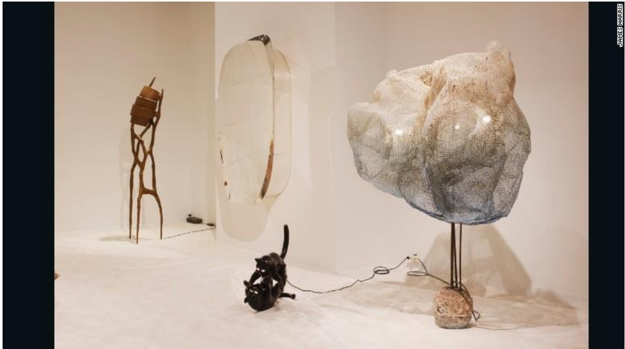
Photos: The best of Design Miami 2016