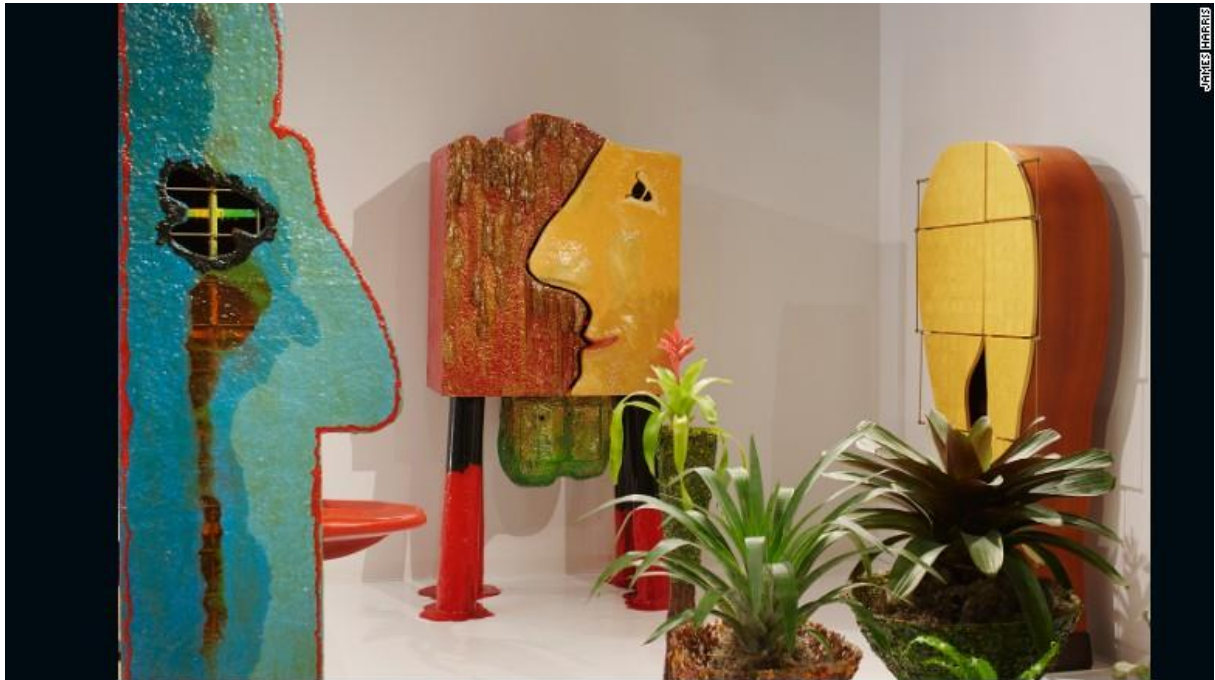
Photos: The best of Design Miami 2016 Salon 94 – Featuring works by Gaetano Pesce. 5 of 12