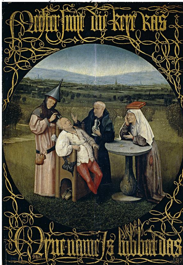
Hieronymus Bosch, The Cure of Folly. The artwork is no longer attributed to the Dutch artist.