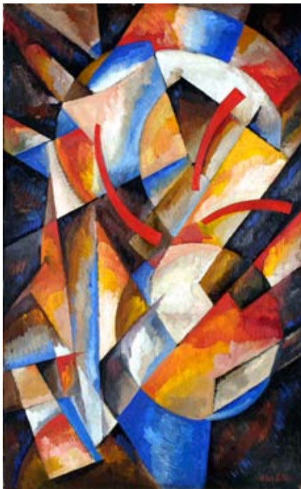
Alexandra Exter, Dynamic of Colours , circa 1917-18 Signed lower right, Oil on canvas, 125 x 77 cm

Hans Arp, Marc Chagall, Jean Dubuffet, Sonia & Robert Delaunay, Alexandra Exter, Frantisek Foltyn, Albert Gleizes, Wassily Kandinsky, Frank Kupka, Fernand Léger, André Masson, Joan Miro, Wolfgang Paalen, Pablo Picasso, Ivan Puni, Antoni Tapiès, Toyen, Maria Elena Vieira da Silva, Otto Wols.