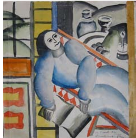
Fernand Léger, Study for Woman and Child , 1922