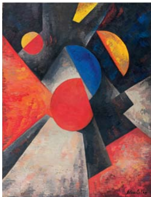
Alexandra Exter (1882-1949)

Abstract Composition, Colour Rhythms , 1917-1918