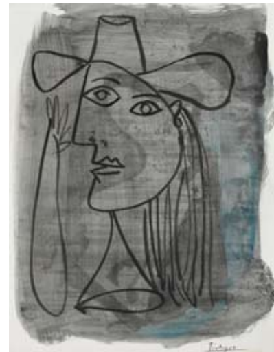
Pablo Picasso, Portrait de Marie-Thérèse , 1937