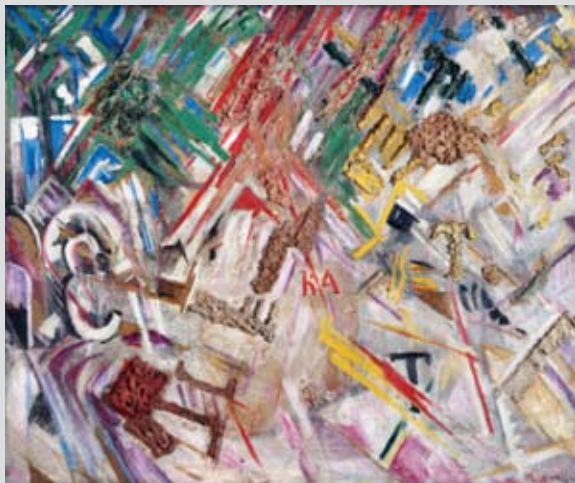
9 • Sunny Day (Pneumo-rayist Colourful Structure) 1913 Musée national d'Art modern, Paris

The spirituality and mysticism, which for Larionov is evoked by the abstract graphic forms of icons and by their subtle colouration and display of faktura , is clearly exploited in his own work. It is by these means that the artist can “orchestrate” timbres that reverberate in the spectator’s soul. 31