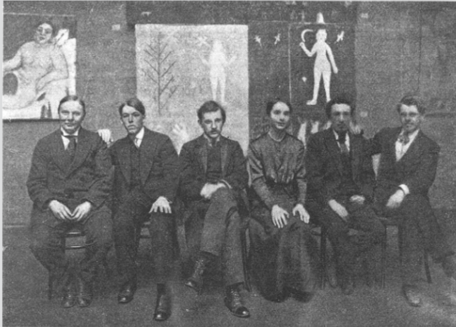
7 • Target, March 1913, Moscow.