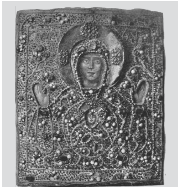
2 • Mother of God of the Sign , 17 th -18 th centuries In, Peasant Art in Russia , London, The Studio, 1912

Conventionally translated as “texture”, the Russian term faktura really references the unique surface qualities of the art work created by the way in which the artist expressively works the medium and materials from which the painting or sculpture is made. In many of his writings Larionov addresses faktura and