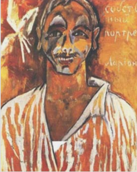
5 • M. Larionov, Self Portrait , 1912 Ex-Tomalina-Larionova Collection, Paris