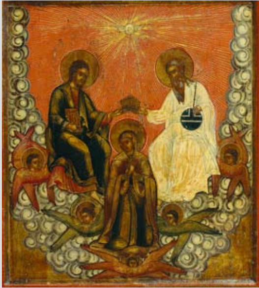
3 • Coronation of the Virgin, North Russia, 1860s