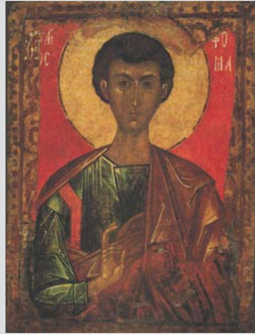
6 • St. Thomas, Novgorod, 15th century State Russian Museum, St. Petersburg

to fulfil royal commissions, and two copies of a book on the small yet distinctive icons of the Stroganov school. 27 Larionov wrote about icons not only in his catalogue introduction to the Exhibition of Original Icon Paintings and Lubki exhibition of 1913 but also later in his unpublished essay entitled, “ Les Icônes ”, written in Paris in the 1920s.